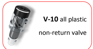
V-10 all plastic non-return valve