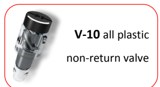
V-10 all plastic non-return valve