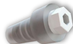
V-40 all plastic valve

For all measurements, weights and other technical data specified in this data sheet, please allow for a deviation of not less than +/-5%. The illustration may deviate from the actual product.